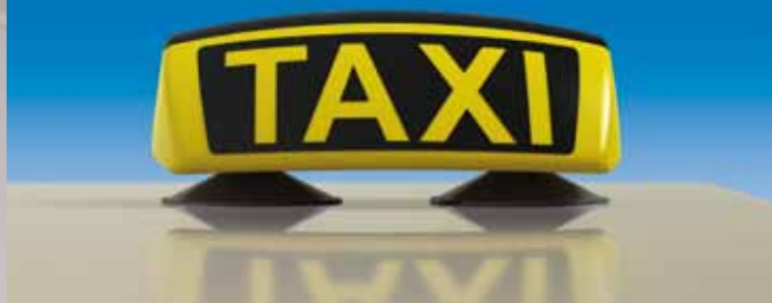
TRS-021 with single-arm bracket